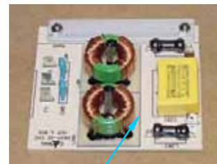
RFI Circuit 990075900