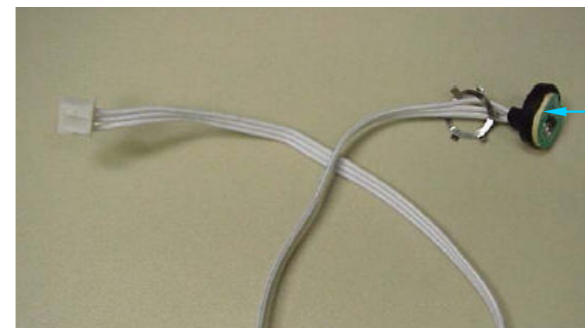
Jar Sensor 990084400