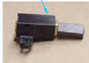
Brush Motor Kit 990075200