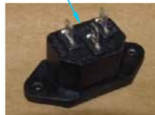
Cord Socket 990064800